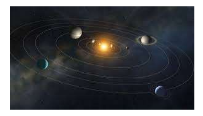
We hope you have an amazing half term!

We also enjoyed a visit from the Planeterium where we learned lots about our solar system and asked lots of questions!