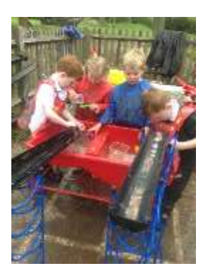
We have also enjoyed both our back and front gardens during our CHIL time.