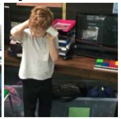
In history, we've enjoyed learning about Ancient Egypt and mummification.